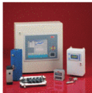
KRAL Volumeter® - Fuel Consumption Measurement System.