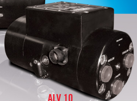
ALV 10 Liquid Fuel Metering Valve