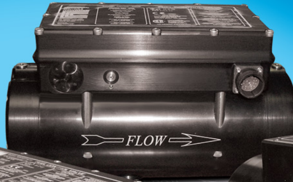
AGV 50 Mid to Large Turbine Gas Valve