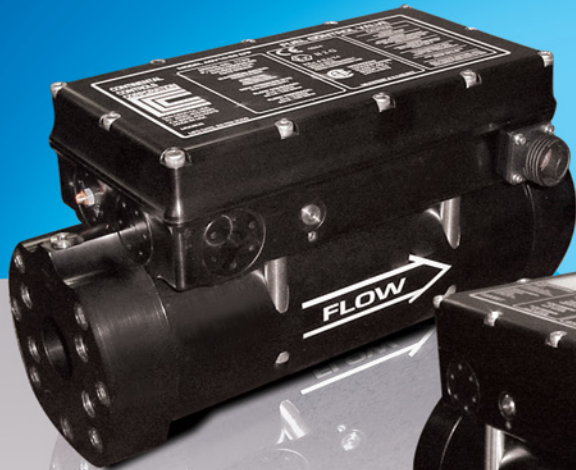
AGV 10 Gas Metering Valve