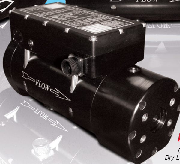
AGV 50 Pilot Gas Pilot Valve for Dry Low NOx Applications*