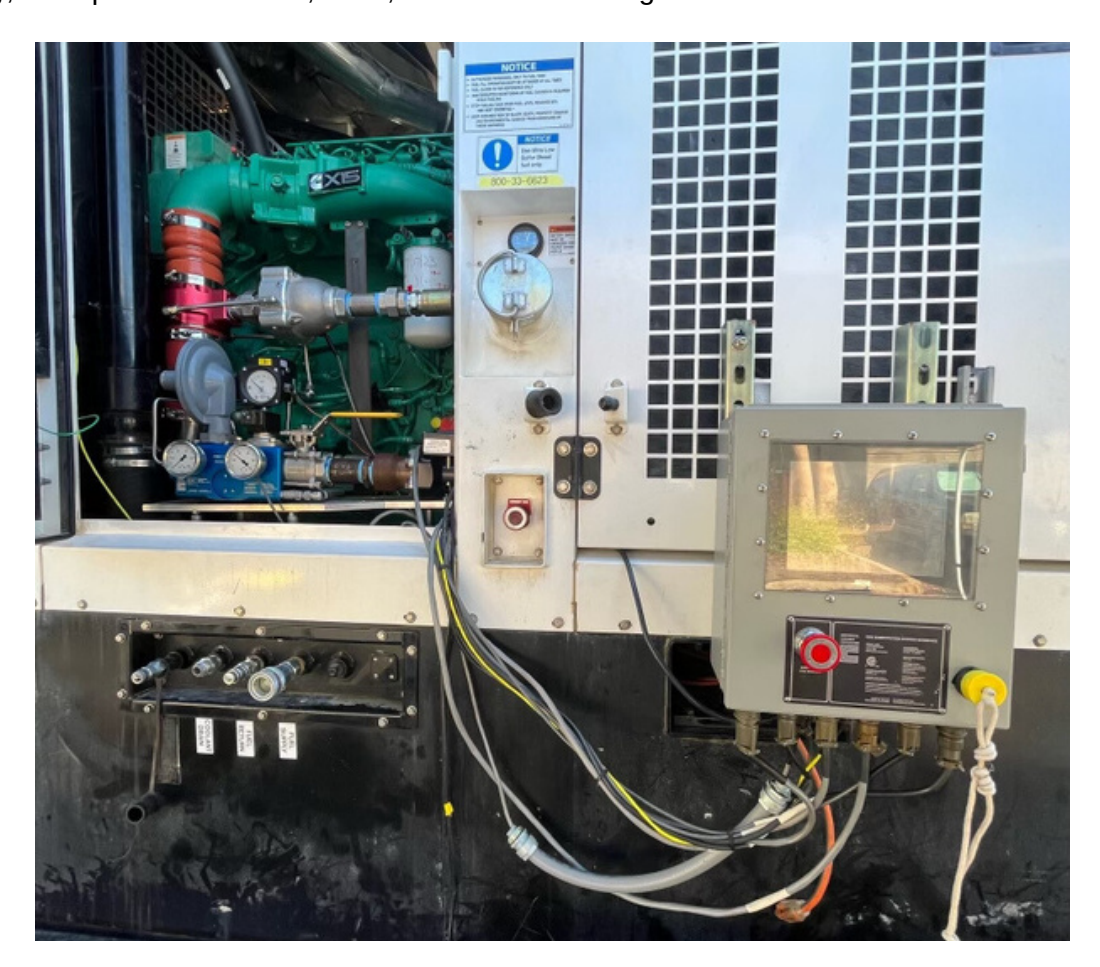
GSSI, FM50, and AFM4 installed on Cummins QSX15

The simplicity of design of the GSS ensures no modifications are required to the engine. The GSS does not interface with the diesel control governor; it remains independent. The components are mounted, secured, and connected onto the exterior of the engine. All OEM engine specifications for injection timing, valve timing, compression ratio, etc., remain unchanged after installation.