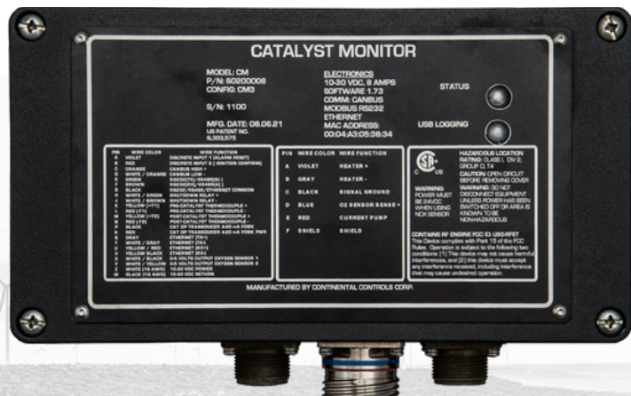
The CCC Cat Monitor is available as a Data Logger and a real-time emissions controller with a CCC AFR valve system.

Gas Engines subject to national or local regulation are required to monitor catalyst temperatures continuously. Catalysts require heat to react with targeted emissions. When this reaction occurs, it is exothermic (produces heat). The Cat Monitor will monitor both pre- and post-catalyst temperature and notify the user if either a minimum or maximum temperature is exceeded as well as provide evidence by a higher post-catalyst temperature, that the catalyst is likely working.